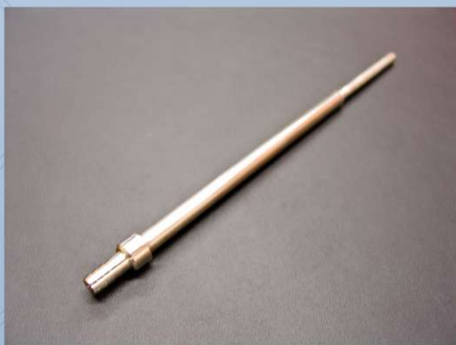
OEM Bosch filler needle