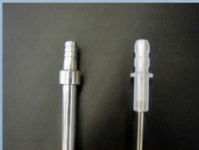
OEM Bosch vs. Overlook Hose Barb