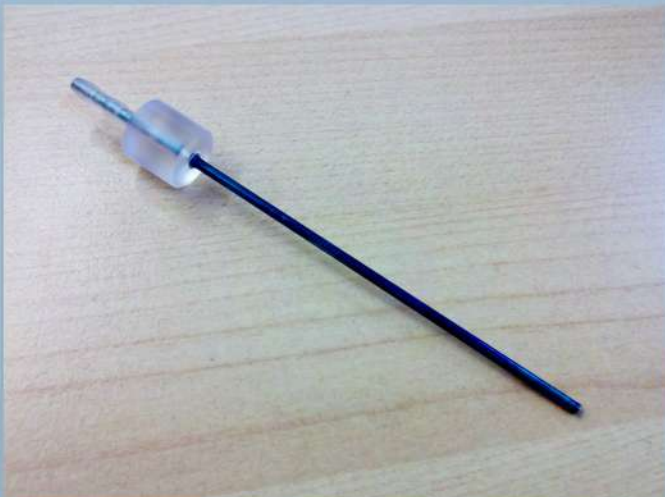
Overlook OneShot™ filler needle w/ "rainbow" coating and hose barb