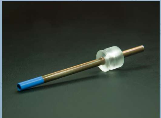
Overlook OneShot™ filler needle w/ Teflon coating