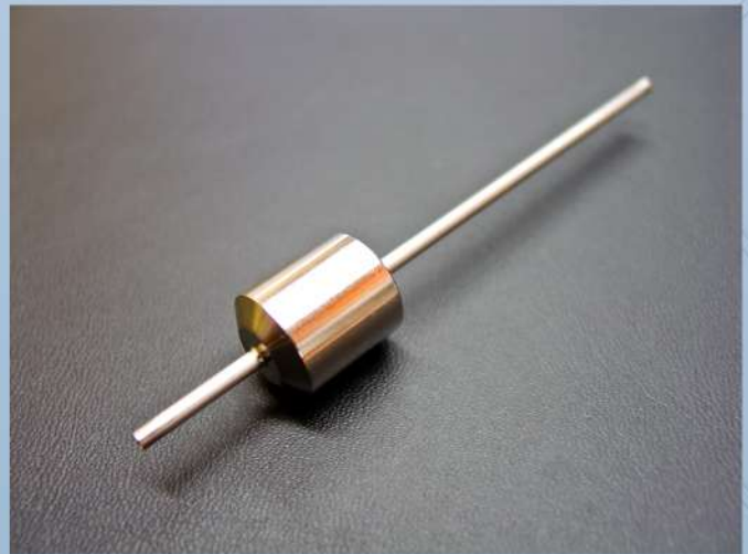
Overlook filler needle