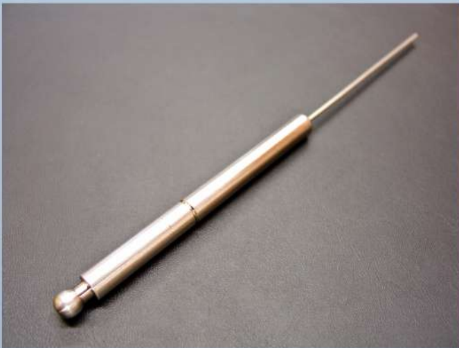
OEM Corima filler needle