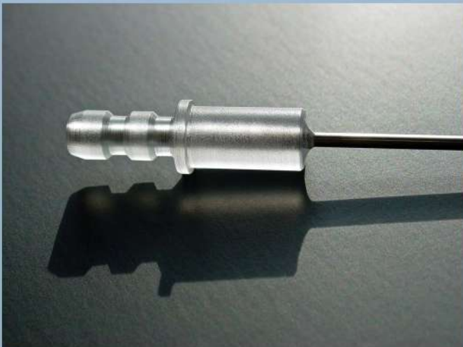
Overlook OneShot™ filler needle