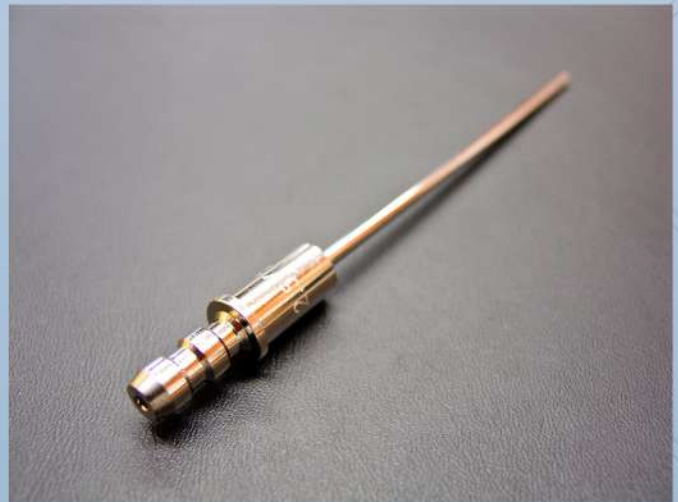
Overlook filler needle