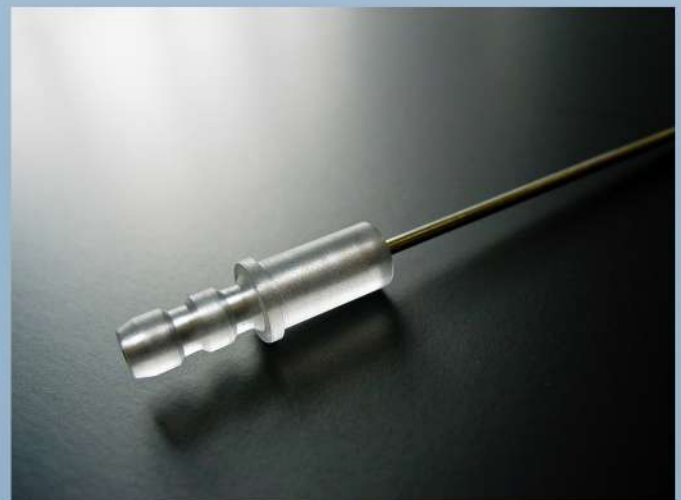
Overlook OneShot™ filler needle