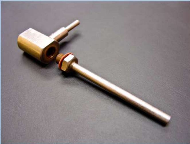
OEM National Instrument filler needle