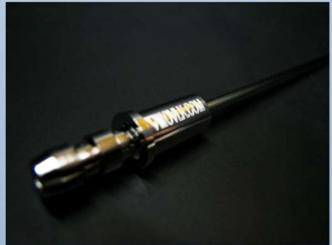
Overlook co-ax filler needle